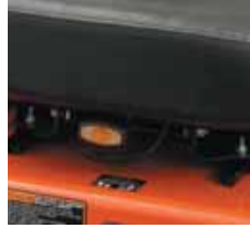
SUSPENSION SEAT ADJUSTMENT LEVER