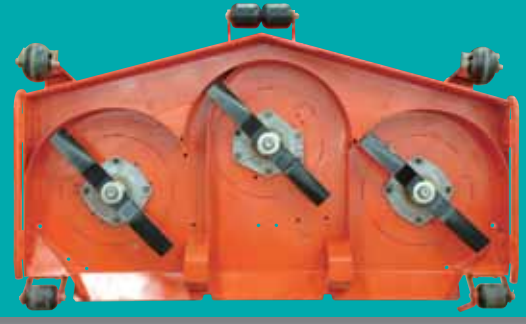
REAR DISCHARGE MOWER