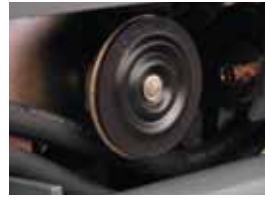
ENGINE COOLANT ALERT