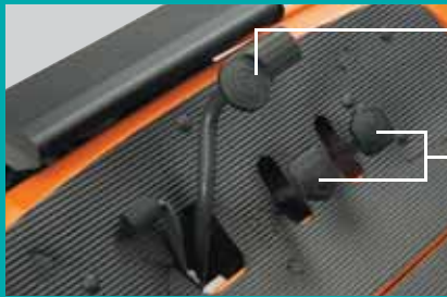
PARKING BRAKE (Hands-free)