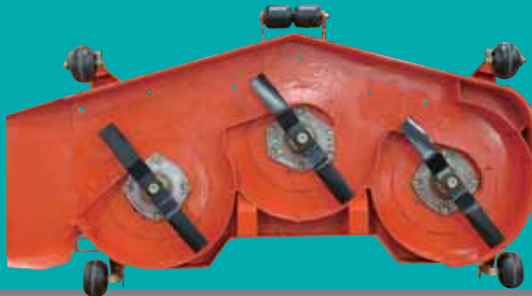
SIDE DISCHARGE MOWER (AVAILABLE BY SPECIAL ORDER)