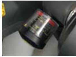
AIR CLEANER INDICATOR